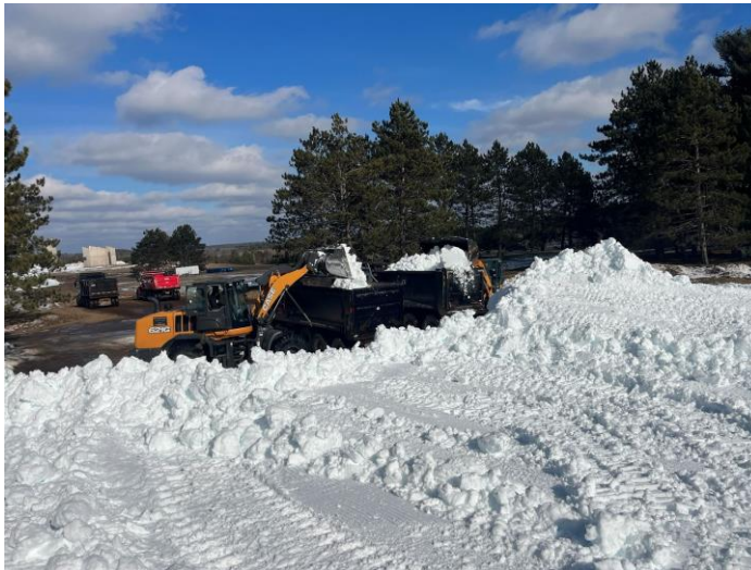
Loading trucks from the whales of machine-made snow

Beattle skied his own race on Thursday and took a much-needed vacation to Florida after that, still marveling at how everything came together to provide a unique and memorable 50th American Birkebeiner race for 10,000 skiers spread out over five days on a 10 km course.