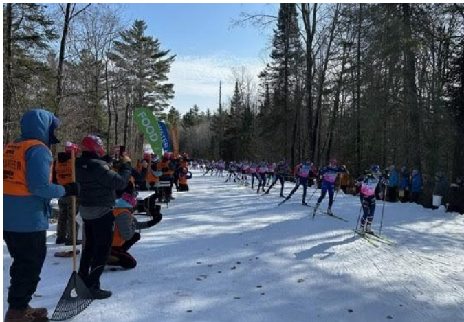
Elite women skiers race past the aid station

https://youtu.be/GcqbLp5iW1U?si=jKzfv4YXBM_2jT0