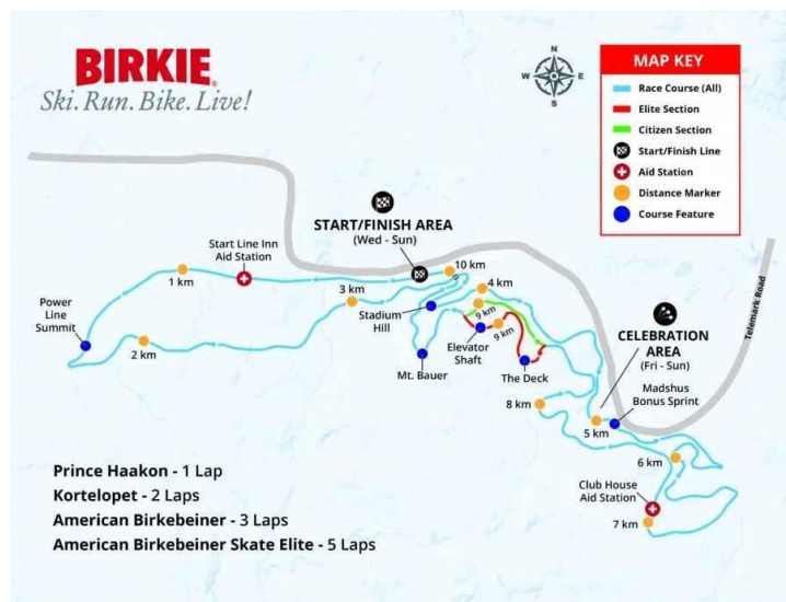
2024 shortened Birkebeiner course using all machine-made snow

https://www.youtube.com/watch?v=9Biache2hVI